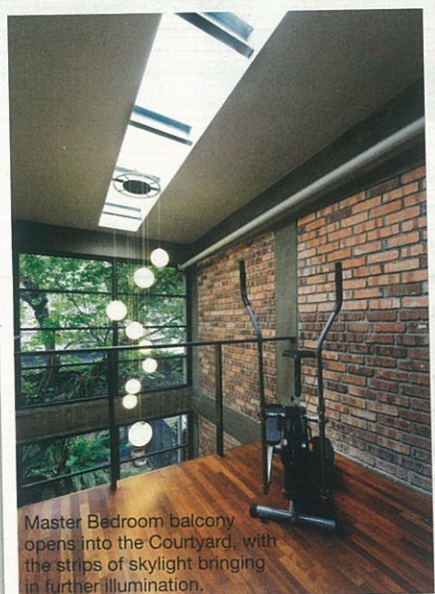
Master Bedroom balcony opens into the Courtyard, with the strips of skylight bringing in further illumination.