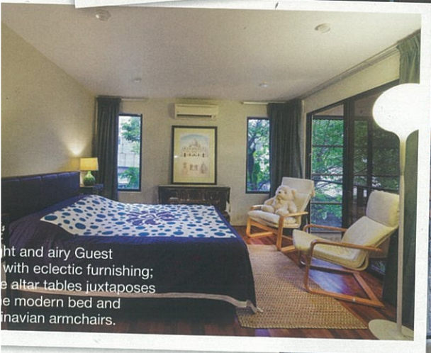
Light and airy Guest Room with eclectic furnishing; the altar tables juxtaposes the modern bed and the modern armchairs.

Beside the Master Bedroom the Library is furnished with a Chinese scholar's table, flanked by a wall-length bookcase in imperial yellow, housing the bibliophile owner's extensive collection of hard-cover tomes of culture, arts and history.