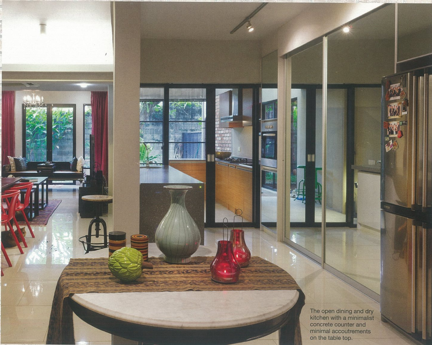
The open dining and dry kitchen with a minimalist concrete counter and minimal accoutrements on the table top.

The dry and wet kitchens form a continuous space when the glass sliding doors are opened up, thereby increasing worktop space when the need arises. Mirrored sliding panels conceal the dry kitchen pantry, hiding clutter usually found on countertops and provides an illusion of additional space for the 22-feet wide townhouse. The island counter is used variably for food preparation as well as bar-height seating with vintage bar stools.