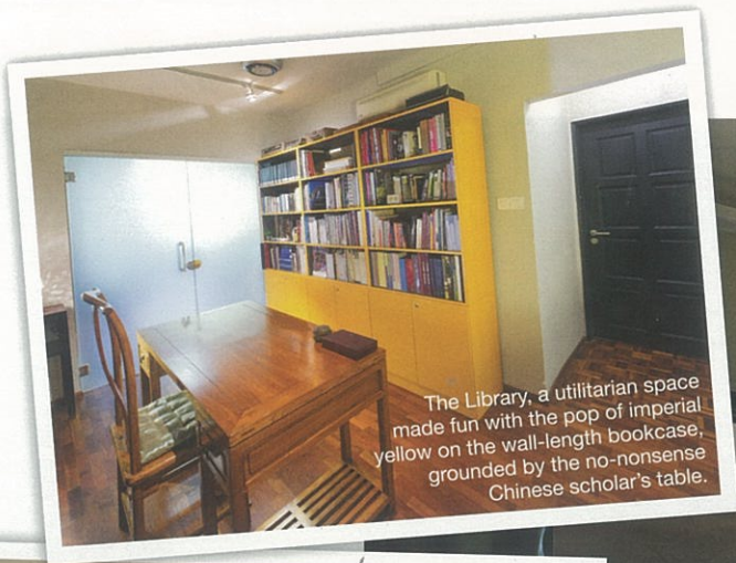
The Library, a utilitarian space made fun with the pop of imperial yellow on the wall-length bookcase, grounded by the no-nonsense Chinese scholar's table.