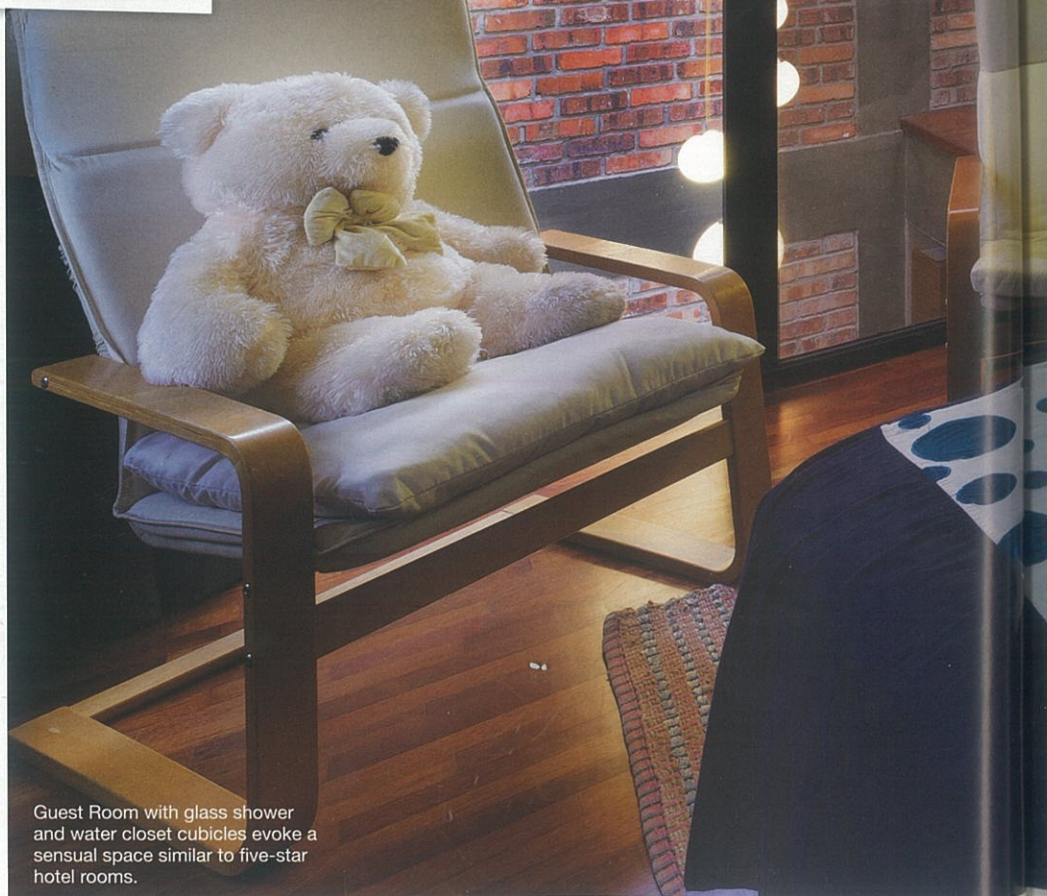
Guest Room with glass shower and water closet cubicles evoke a sensual space similar to five-star hotel rooms.