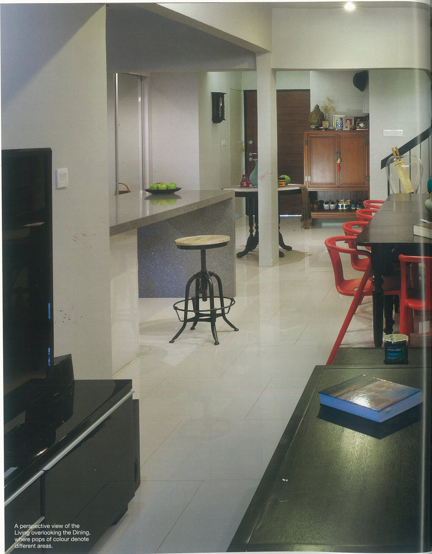
A perspective view of the Living overlooking the Dining, where pops of colour denote different areas.