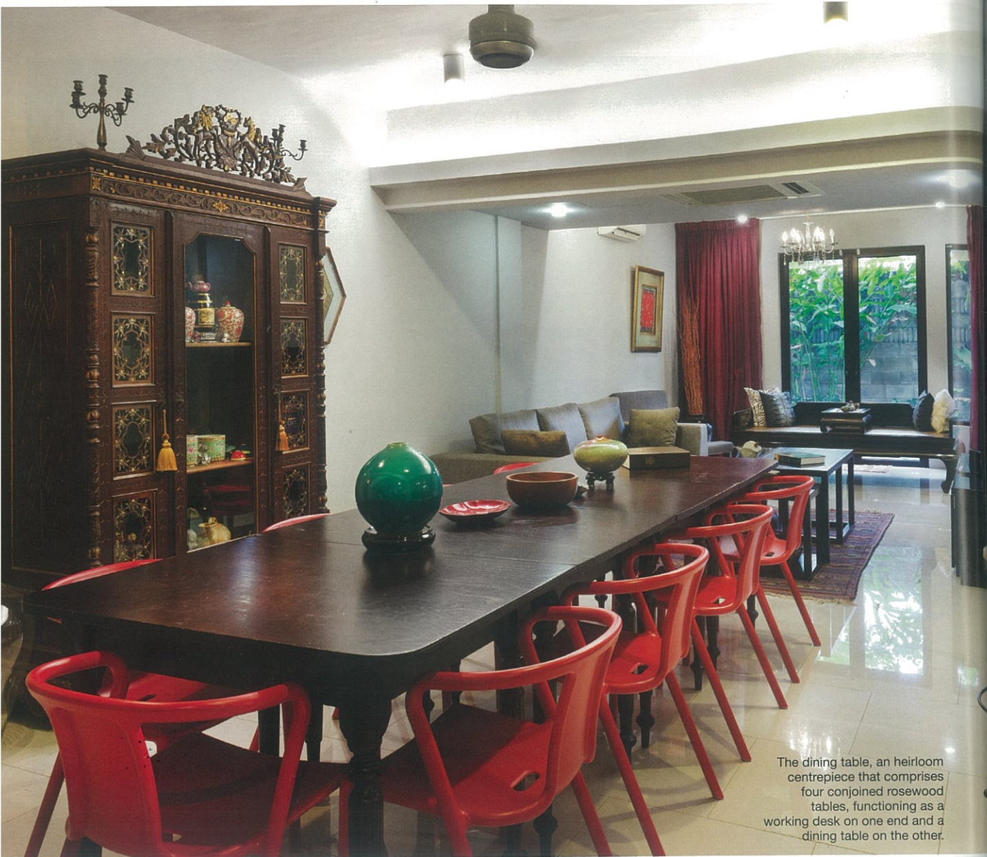
The dining table, an heirloom centrepiece that comprises four conjoined rosewood tables, functioning as a working desk on one end and a dining table on the other.

Upon entry a salvaged coffee-shop marble top table becomes a vestibule centrepiece and console, strategically blocking a structural column. A small powder room is discreetly located to the right of the extra-wide timber door, while a shoe cupboard disguised as a Chinese cabinet fits on the left.