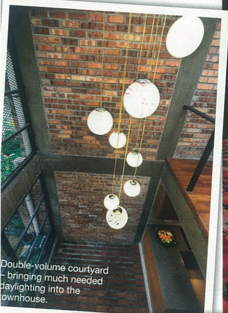
Double-volume courtyard - bringing much needed daylighting into the townhouse.